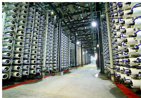
..... Tel Aviv, Israël