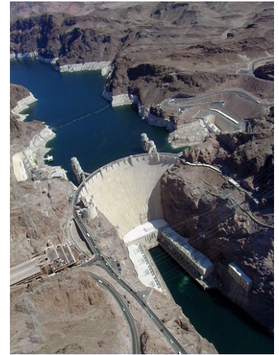
..... Hoover sur la Tennessee, USA