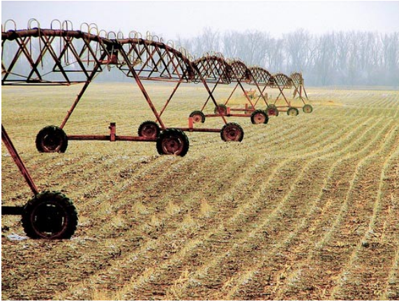
....., Nebraska, USA