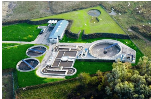
....., Engis, Belgique