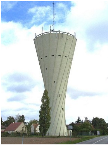
..... Les Essarts-le-Roi, Yvelines